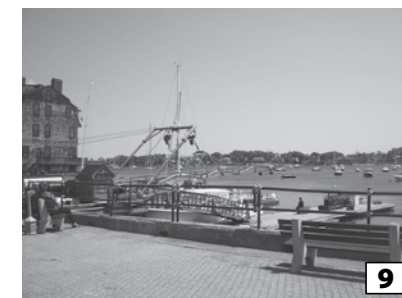
State Street Wharf / Town Landing