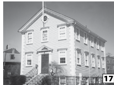
Old Town House

One block past the Town House is Pleasant Street, with buildings mainly from the 1800s. It leads to where the town's largest shoe factories were located in the mid- to late-1800s, in an area that suffered two major fires, in 1877 and 1888.