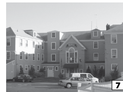
Boston Yacht Club

the Museum's galleries across the street at 170 Washington Street highlight specific aspects of the collections. Research archives and galleries open year-round, Tuesday–Friday, 10am–4pm.