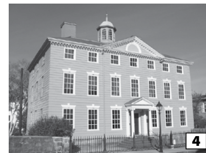
Colonel Jeremiah Lee Mansion Open to public seasonally