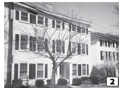
Samuel Lee House

As you leave Abbot Hall by the Washington Street entrance, turn right going down the hill. On the left you will see three privately-owned houses (numbers 185, 183 2 and 181) built during the mid-18th century by members of the Lee and Hooper families—successful ship owners and merchants.