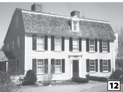
Thomas Gerry House