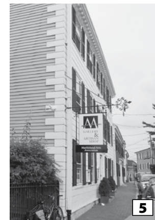
King Hooper Mansion Open to the public

Built in 1768 by Colonel Lee, a wealthy merchant and distinguished patriot, it is a superb example of pre-Revolutionary gentry living, with outstanding furniture and decorative objects of the period, original and virtually unique hand-painted English wallpapers, and some of the most elaborate interior woodwork carving in America. Rich mahogany paneling from the West Indies and fine ceramics, glass and hand-painted wallpaper from England were brought to America in Lee's and other merchants' ships.