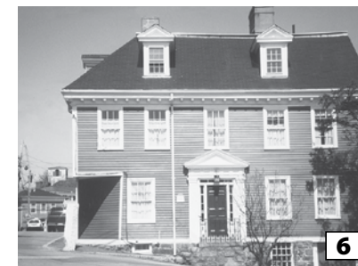
J. Palmer / Jeremiah Lee ("Lafayette") House

The Jeremiah Lee Mansion is owned by the Marblehead Museum & Historical Society , and is open June–October, Tuesday–Saturday 10am–4pm; closed Sunday and Monday. Special exhibits at