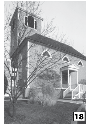
St. Michael's Church

and a period altarpiece. When news of the Declaration of Independence reached Marblehead, patriots broke into this citadel of Toryism, removed the royal