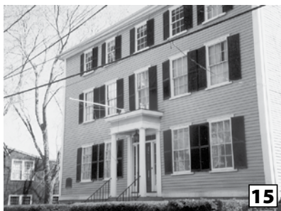
Elbridge Gerry House

The beautiful codfish weather vane on the steeple is made of gilded copper, and is 52 inches long. It is believed to have been made about 1700, although the artisan is not known.