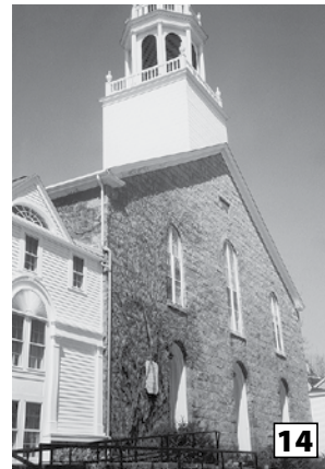
Old North Church

who encouraged the men of Marblehead to resume the town's foreign trade. The house was built c. 1717