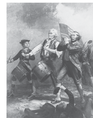
The Spirit of '76

For further information, visit www.marblehead.org and click on Marblehead Historical Commission under the online heading Visiting & Town History .