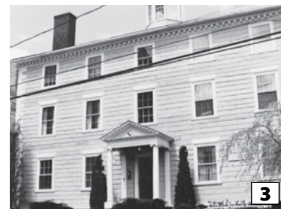
R. Hooper / Wm. R. Lee House