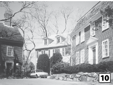
Glover Square & General John Glover House