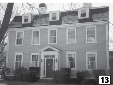
Rev. John Barnard House